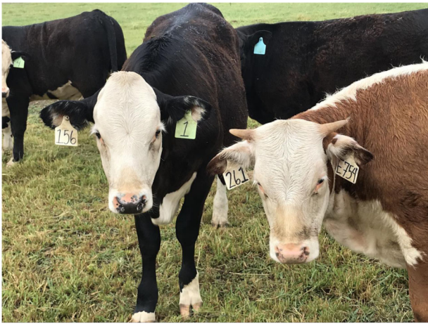
Fig. 1 Hornless offspring of a gene edited bull alongside a horned control cow. The reason cattle differ in their coat color, or whether or not they grow horns, is due to naturally occurring DNA sequence variations in their genome. These DNA sequence variations can also be introduced using gene editing as occurred with this black cow (#1) who inherited a gene-edited POLLED DNA sequence variant ( P_C allele) from her father, and as a result she is genetically hornless.

Traditional plant breeding programs have used mutagenic chemicals like ethyl methane sulfonate or fast neutron irradiation to induce mutations, or changes, in DNA sequences at random loci throughout the genome in an attempt to generate novel trait variation since the 1930s. 7 This increases the genetic variation that is available to breeding programs. 8 The widespread use of mutation techniques in plant breeding programs throughout the world has generated thousands of novel crop varieties in hundreds of crop species. There are over 3200 mutant varieties from 214 different plant species officially released in more than 70 countries as referenced in the Mutant Varieties Database ( https://mvd.iaea.org/ ). There are no unique regulatory guidelines or tracking required for these varieties, and there do not appear to be any documented examples in which mutant varieties were removed from the market due to unintended or unexpected adverse incidents. 3